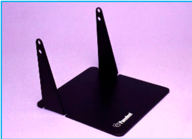
2280 ME Mandibular Mounting Stand (MMS)

The Axis Mounting System is used for mounting the maxillary cast to the true hinge axis and can also be used for mounting the average (ear-bow) axis. It comes with a built in bite fork support and remount jig. Also included is the Cross Rod and Clamp used with the Pana-Mount ™ Face-Bow and axis recording arms to transfer of the patient's cast on the hinge axis.