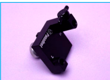
4054 ME Mounting Fixture (Low / High-Panadent, Whip-Mix)

The Bite-Fork Support (magnetic) System was developed to create a sturdy platform for an easy to use method of supporting the Bite-Fork during mounting procedures on the articulator without having to use plaster.