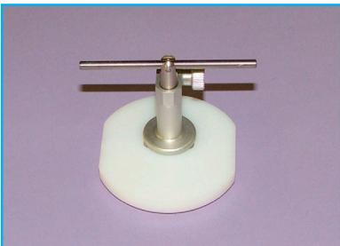
2870 ME Bite-Fork Support

The spacer is attached to the mandibular frame of "H" (high model) Panadent articulator to convert it to be compatible with the discontinued "L" model articulator. Casts which have been mounted on low (L) model articulators can be transferred to a high (H) model articulators provided this spacer is placed on the mandibular frame of the high (H) articulator.