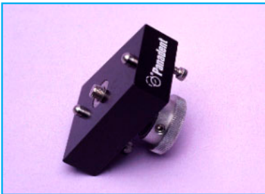
2479 ME Mandibular Mounting Plate Spacer Assy.

The Mandibular Mounting Stand supports the articulator upside down to aid in mounting the mandibular cast. Inserting the Dyna-Link pins into the holes in the stand creates a solid support for the articulator. The front of the articulator can be adjusted with the support pin to level cast to prevent the mounting stone from sliding off the cast during the mounting procedure.