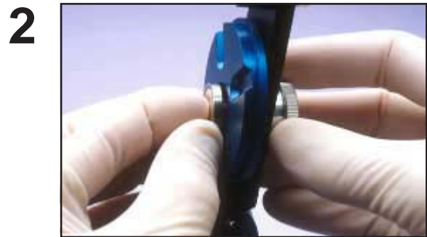
Attach Magnet to Mounting Plate with mounting plate screw.