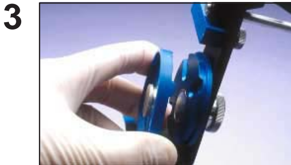
Place plastic index plate to metal magnetic mounting plate.