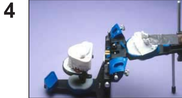
Add plaster to plastic index plate and study cast to mount models in usual manner.