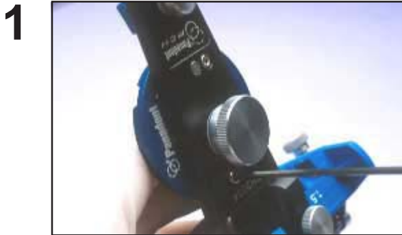
Fasten Metal Mounting Plate to Articulator with fastening screws.