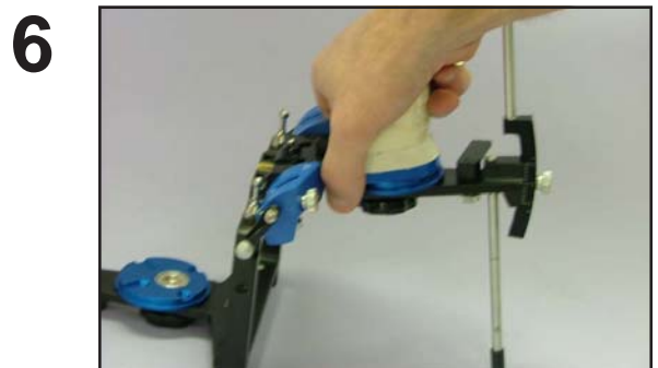
To prevent casts from separating from mounting plate, grasp the cast and mounting plate with thumb and fingers. Tilt the mounted cast assembly sideways to release cast from mounting plate magnet. (Do not pull on mounted casts.)

Check to make sure your magnet is still on your articulator, without a magnet, your stone transfer plates will not connect.